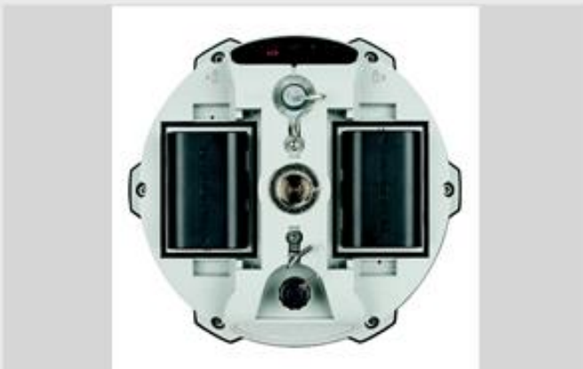
FGS 1 Antenna with optional radio modem